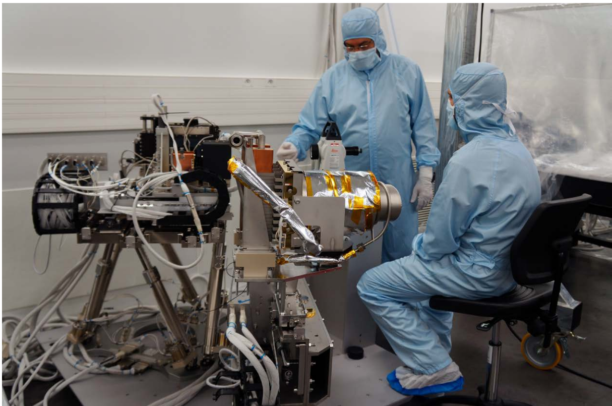
IA DEA (right of image, with gold / silver cladding) testing set-up. SYMÉTRIE's hexapod is shown on the left.

RESOLUTE with BiSS ® protocol offers SYMÉTRIE advanced capabilities that continue to