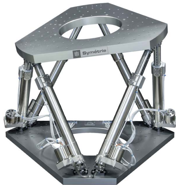
SYMÉTRIE's ZONDA hexapod for IA DEA (Interferometry Assembly Detection Electronics Assembly)

"We chose Renishaw's RESOLUTE absolute encoders because of their high level of metrology performance. These absolute encoders work reliably in high vacuum conditions. Moreover, the encoder scale is made of low expansion